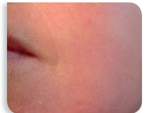
Significant improvement of wrinkle