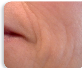
Premature wrinkle formation